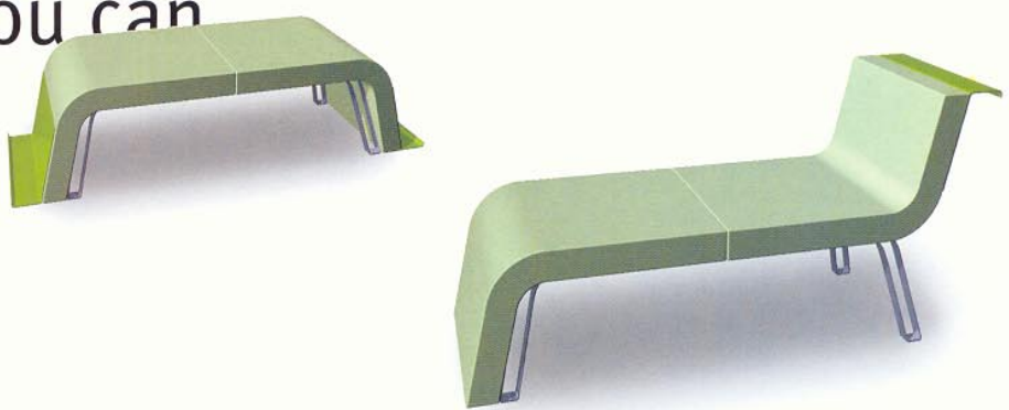
FLIP, 2002 With just two upholstered components, Flip can be arranged as a sofa, loveseat, banquette, recliner, or daybed. Ellie shelving can be attached to the seat backs. 47.2 x 30.7 x 23.6 in.

“I learned the value of feeling dissatisfied. And I learned that you can always work more.”