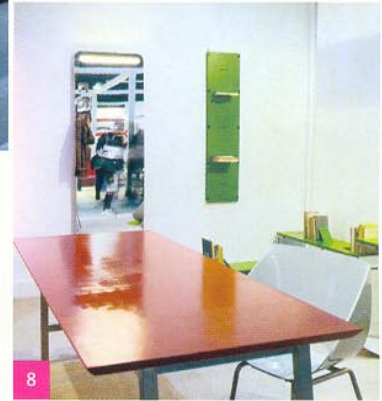
HILOLY 7 Hinged-leg construction permits a single user to raise the table surface from lounge level to desk height. 8 70.9 x 31.5 x 28.4 in.